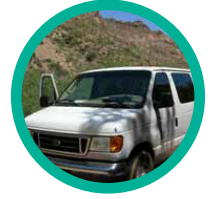
SOUTHWEST TOURS 602.971.1381 southwesttours.com