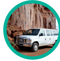
ACROSS ARIZONA TOURS 602.233.1813 acrossarizonatours.com