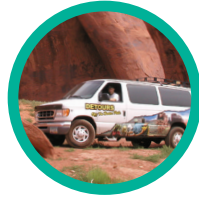
DETOURS OF ARIZONA 480.633.9013 detoursaz.com