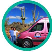
PINK ADVENTURE TOURS 480.946.1444 pinkadventuretourscottsdale.com

Professional ground tour operators offer fun and easy day trips from Scottsdale to the Grand Canyon's South Rim. Luxury vans, professional drivers and expert guides will take you from place to place while you sit back, relax and enjoy the scenery.